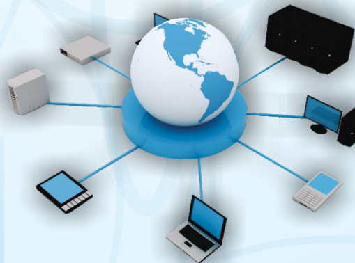
Cloud Server (A3.Criti.Serve)