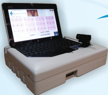
Patient Side Unit (A3.CritiView.Standard)

Extreme reliability of operation in spite of unreliable environment/infrastructure in India Quality, precision, integrity of medical Information presented Integrates with existing medical-healthcare ecosystem Scalability to a very large number of installations Maintainability of equipment – remote Solar power charging